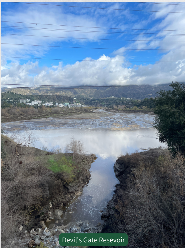
Devil's Gate Reservoir