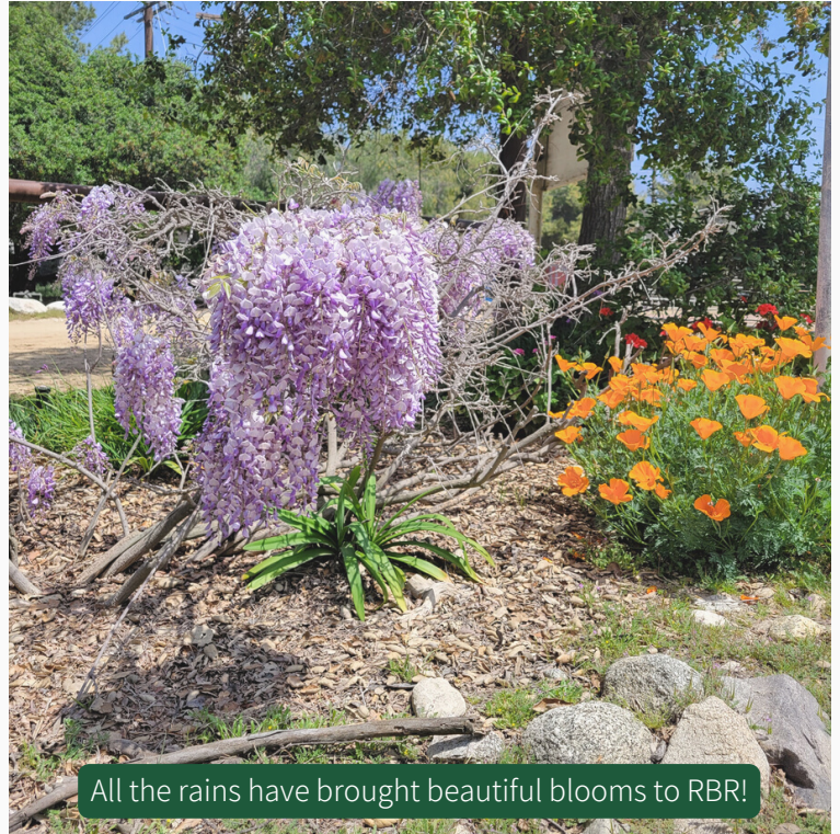
All the rains have brought beautiful blooms to RBR!