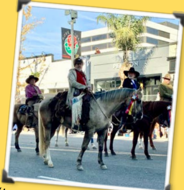
"I walked down Colorado Blvd in The Rose Parade." -Whiskey