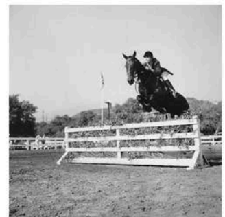
Assorted photographs from the RBR archives